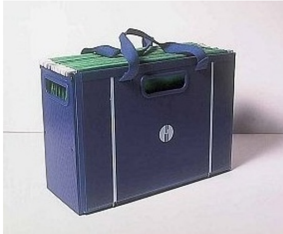
Illustration of straps and box loaded with filing suspenders